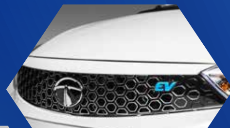
Diamond front grille with chrome humanity line