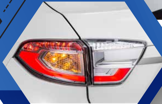
Crystal-inspired LED tail lamps