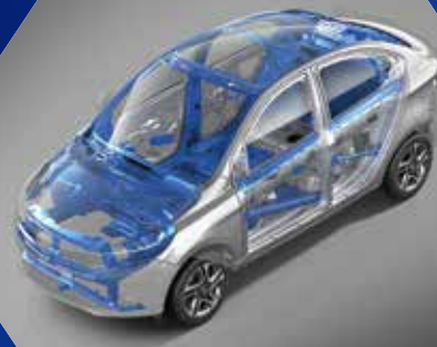
Reliable architecture with cocoon like safety cell