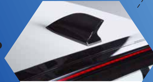
Piano Black shark fin antenna and LED high mounted stop lamp