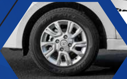
Stylish alloy wheels (Available in XT only)