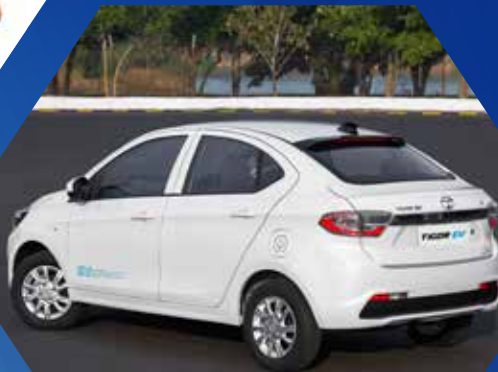
Breakfree coupe - inspired roof line