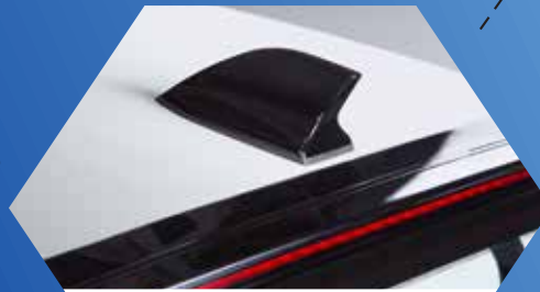
Piano Black shark fin antenna and LED high mounted stop lamp