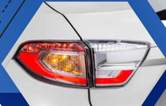
Crystal-inspired LED tail lamps