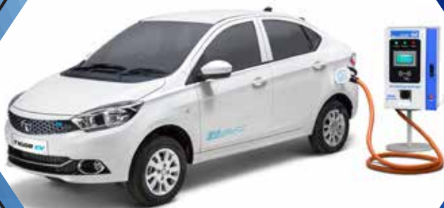
Fast charging socket - 0 to 80% in 120 min*