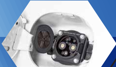
Fast charging socket - 0 to 80% in 120 min*