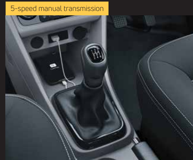
5-speed manual transmission