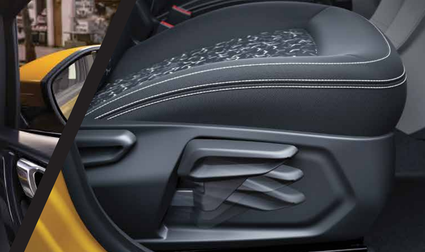
Height adjustable driver seat