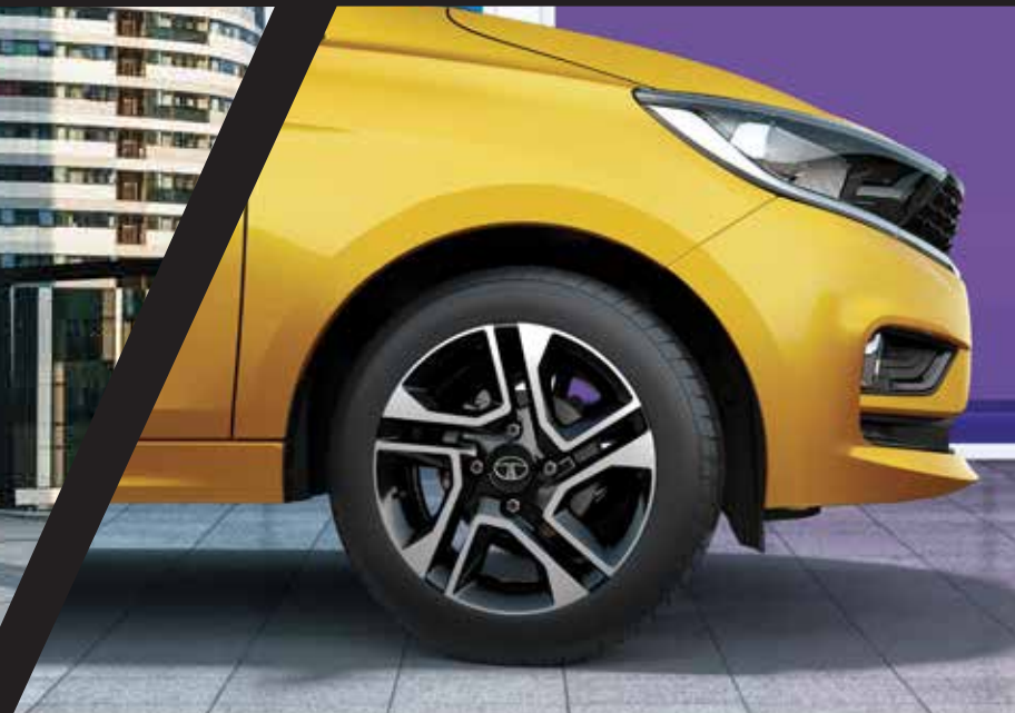
Trendy R15 dual tone alloy wheels