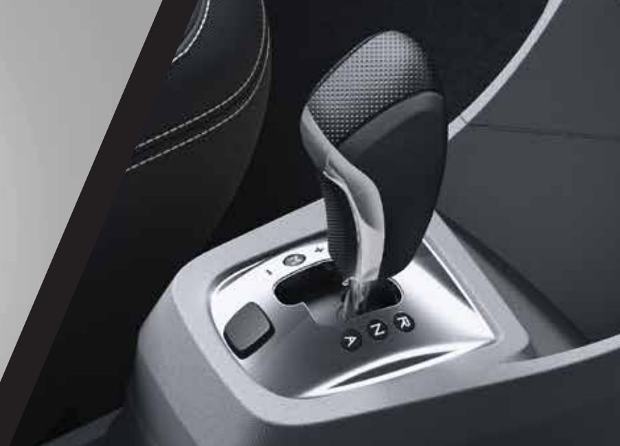
Best-in-class advanced AMT transmission