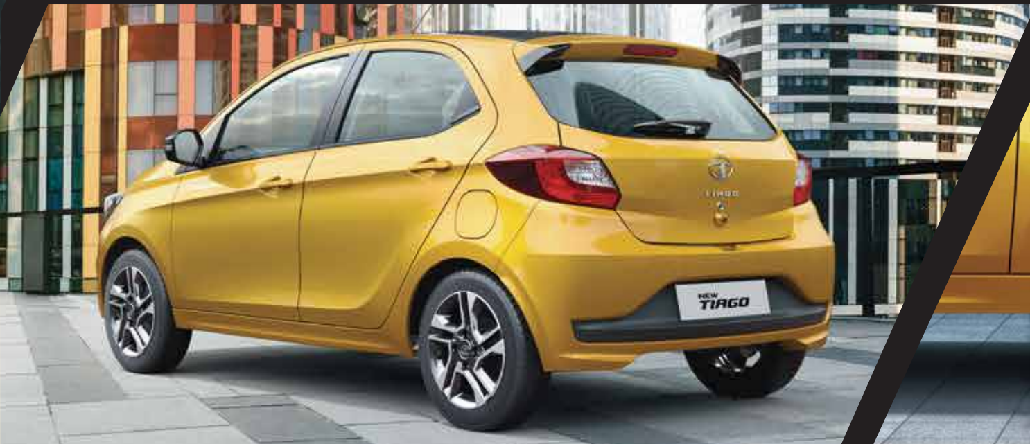
Boomerang shaped tail lamps with rear defogger and wiper

Front Fog lamps: Chrome garnished fog Lamps