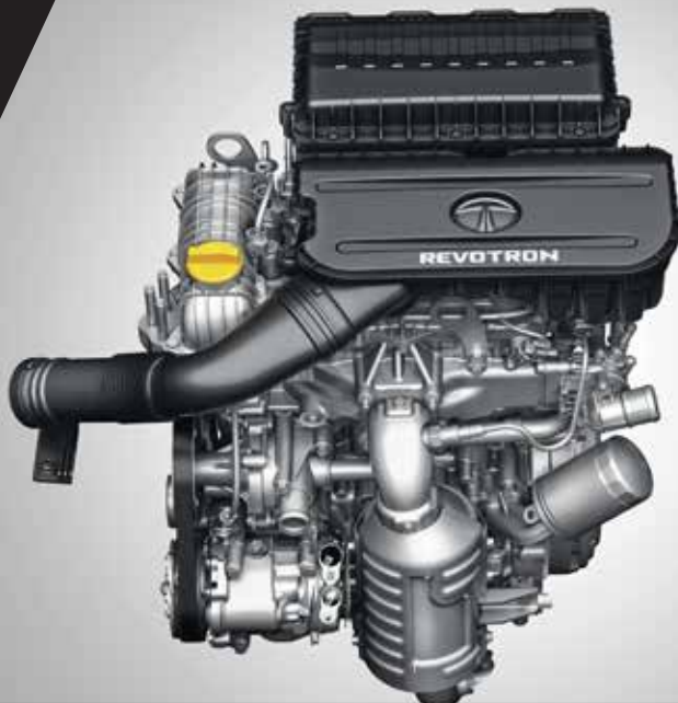
1.2 L Revotron BS6 petrol engine.